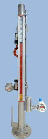
Magnetic Level Gauge